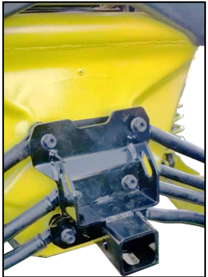
“Figure 3” Receiver Install