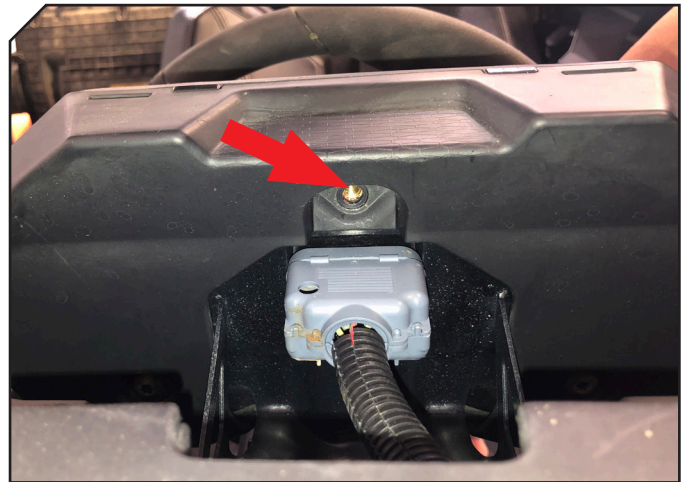
REMOVE STOCK SCREW

Using a T27, remove the torx screw on the backside of the stock gauge cluster