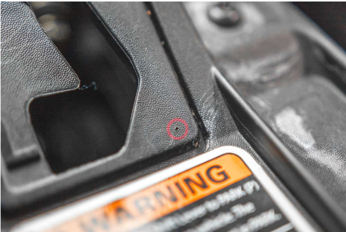
Step 3: Drill the four holes for the mounting of the shift gate.