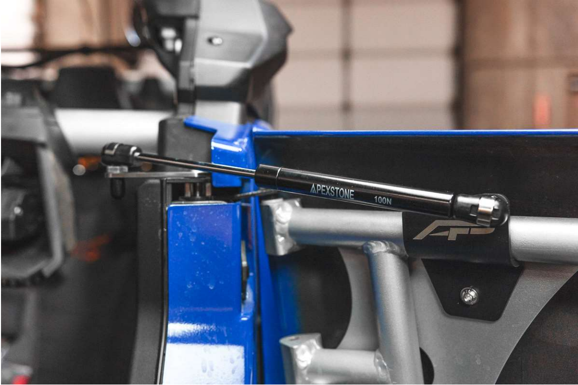
Rear Door Installation