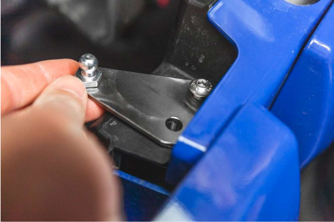
Step 5: Tighten both door hinge bolts with the HW5 bit and provided hardware.