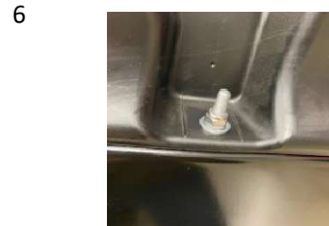
INSTALL SUPPLIED BOLT, WASHER ON PLASTIC SIDE