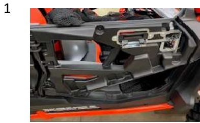
REMOVE DOOR SKIN

TOOLS NEEDED FOR INSTALL: Drill, .250 drill bit, clamp, 7/16 wrench, 3/16 allen wrench