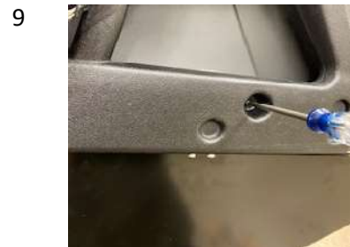
REINSTALL DOOR SKIN

PLEASE GIVE @AJKOFFROAD A SHOUT OUT ON SOCIAL MEDIA AFTER INSTALL