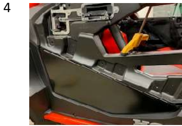
DOUBLE CHECK FITMENT