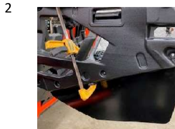
USE CLAMP TO HOLD LOWER DOOR TO DOOR