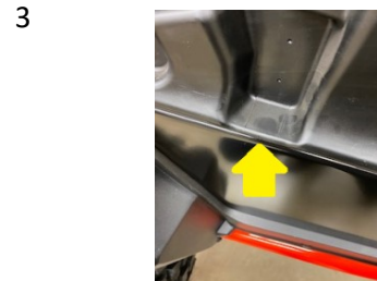
MAKE SURE LOWER DOOR IS FLUSH WITH FRONT DOOR AND OUT A LITTLE FOR REAR DOOR