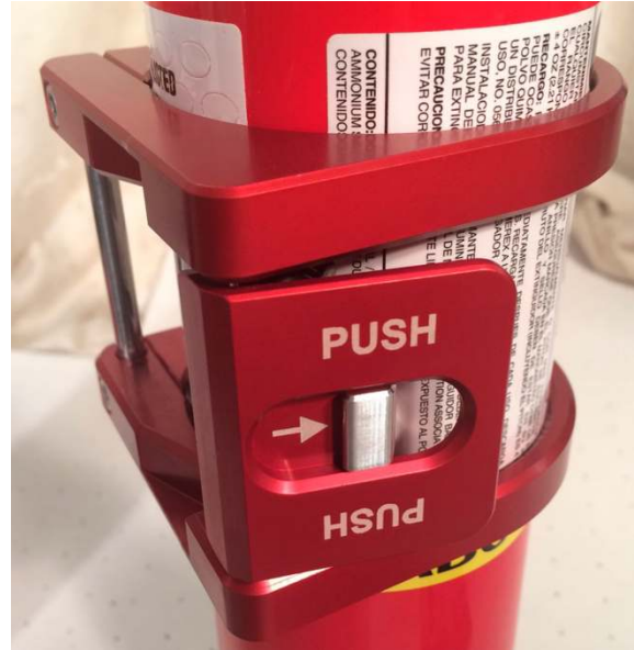
Sector Seven Fire Extinguisher Mount Bottle Clamp Black Left Hand (red)