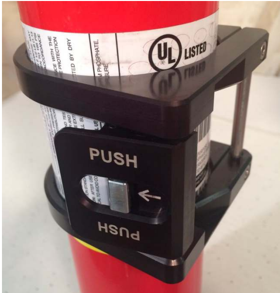
Sector Seven Fire Extinguisher Mount Bottle Clamp Black Left Hand (black)