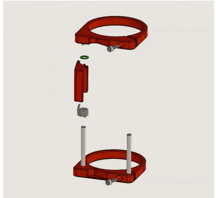
Fig. B: Sector Seven UTV Fire Mount Ring Assembly