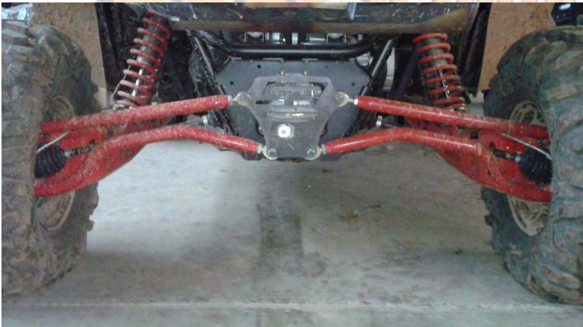
Above image is the rear of a RZR 900 XP